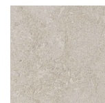
SANDBLASTED & BRUSHED